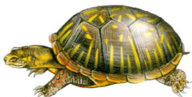
Western Box Turtle Terrapene ornata To 6 in. (15 cm)