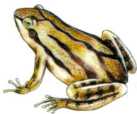
Chorus Frog Pseudacris triseriata To 1.5 in. (4 cm) Note dark stripes on back. Call sounds like running a thumbnail over the teeth of a comb.