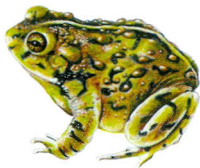
Boreal Toad Bufo boreas To 4 in. (10 cm) Males have a soft, clucking call.