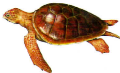
Loggerhead Sea Turtle Caretta caretta To 2.1 m (7 ft.) One of 6 marine turtles that occur in Australia.