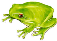
Green Tree-frog Litoria caerulea To 10 cm (4 in.) Note toe pads. Call is a repeated – crawk-crawk.