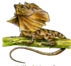
Frilled Lizard Chlamydosaurus kingii To 90 cm (3 ft.) Frill is erected as a defensive mechanism. Australia's national reptile.