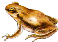
Naked Tree-frog Litoria rubella To 4 cm (1.6 in.) Call is a pulsing note that rises near the end.