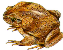
Cane Toad Bufo marinus To 25 cm (10 in.) Large introduced toad has large glands behind its head and horizontal pupils.