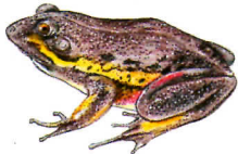
Northern Banjo Frog Limnodynastes terraereginae To 8 cm (3 in.) Call sounds like a banjo being plucked – plonk-plonk-plonk.