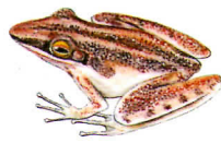
Striped Rocket Frog Litoria nasuta To 5 cm (2 in.) Note long snout. Call is a repeated – wick-wick-wick.